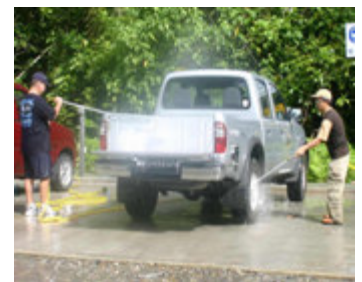
In addition to the cars getting a wash looks like a few of our volunteers got a shower as well.