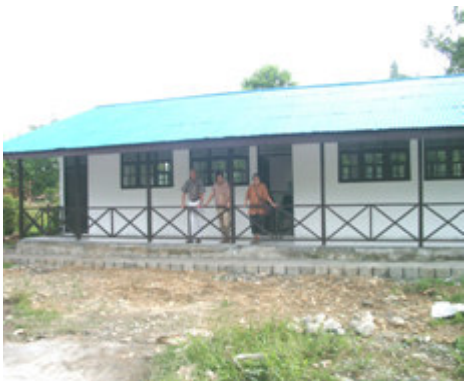
KBMY School Facility in Kwamki Lama

The new KBMY facility in Kwamki Lama , Timika is nearing completion . The building was donated to KBMY but lacked many basic features necessary for use as a school. Financial assistance from PEP and other KBMY benefactors allowed KBMY to build bathrooms , an office , install electrical wiring , lighting , floor tile, windows, doors , paint and roof repairs all of which have been completed. With the additional funds raised by the car wash and direct donations PEP can assist in the purchase of furnishing to truly make this a great learning environment for the kids.