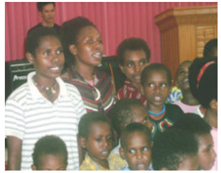
All who participated in the competition and celebrations came away winners !