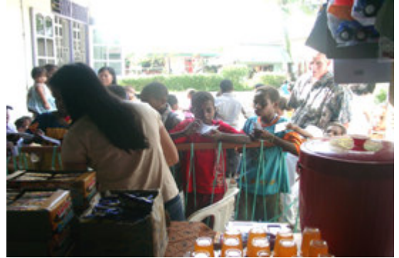
Top competitors spending their well deserved winnings on snacks and drinks.