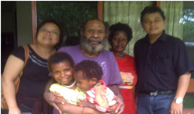
With a Kampung Tengah elder and his family. April 2012

Based on observations and feedback from the people, Sekolah Penuai aims to open two more kindergartens next year. One TK in Kampung Tengah in Kwamki Lama, and one TK in Gorong2, Timika.