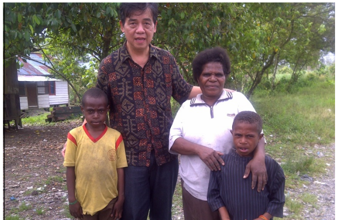
With mama Gai and her children in Gorong2 - September 2012

The plan to open more school is in line with the School Planting campaign sponsored by Sekolah Penuai. To find out more about the concept, please click the following presentation: School Planting .